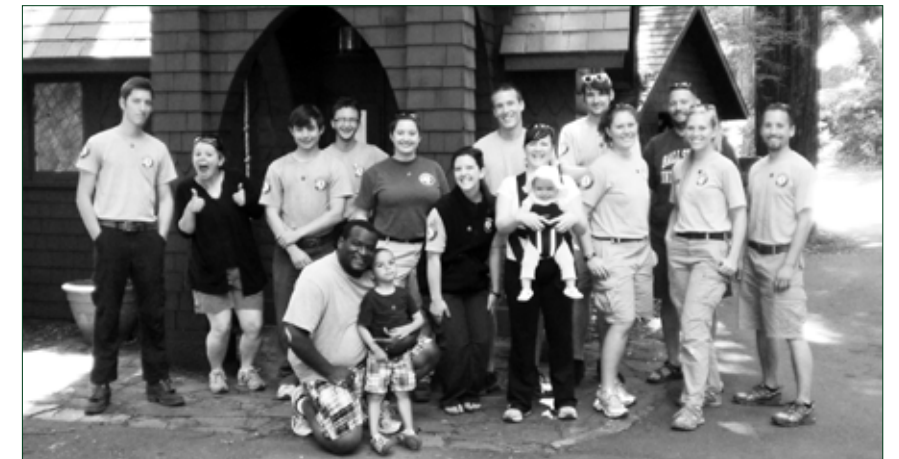
The three AmeriCorps NCCC teams that served at St. Dorothy's Rest in 2011.